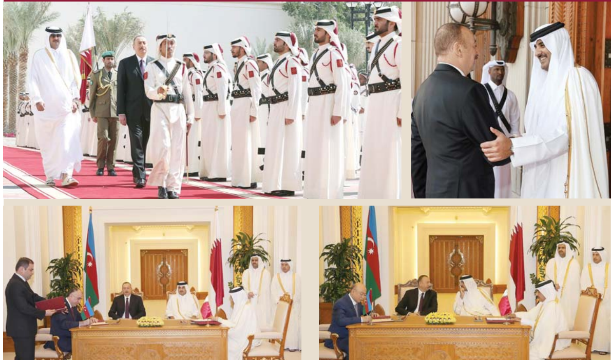
Emir H H Sheikh Tamim bin Hamad Al Thani held talks with the President of the Republic of Azerbaijan, Ilham Aliyev, in Doha yesterday. Later, Emir and President of Azerbaijan witnessed the signing of a number of agreements between the two countries.