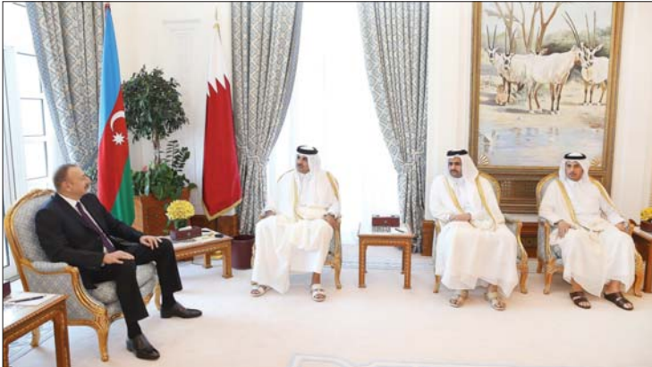
Emir H H Sheikh Tamim bin Hamad Al Thani and President of Azerbaijan, Ilham Aliyev, during talks at the Emiri Diwan, yesterday. Deputy Emir H H Sheikh Abdullah bin Hamad Al Thani and Prime Minister and Interior Minister H E Sheikh Abdullah bin Nasser bin Khalifa Al Thani also present.

They reviewed bilateral relations and the means to enhance them in all fields.