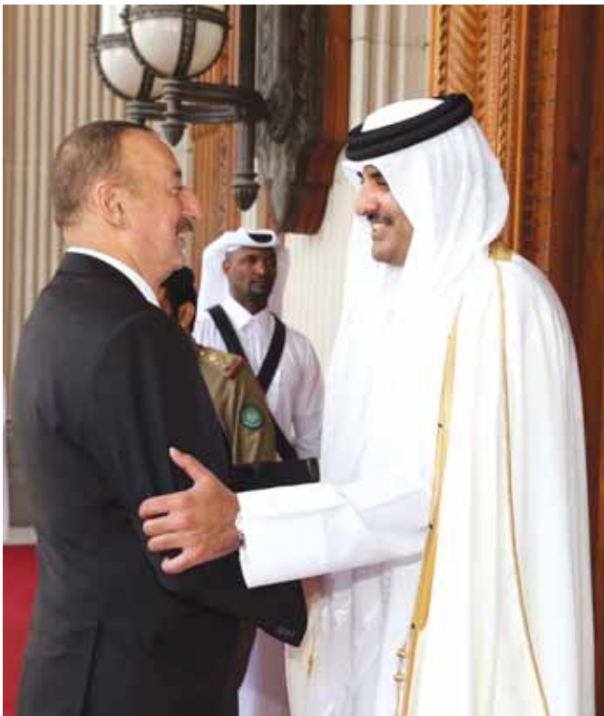
HH the Emir Sheikh Tamim bin Hamad al-Thani receiving Azerbaijan President Ilham Aliyev at the Emiri Diwan yesterday.