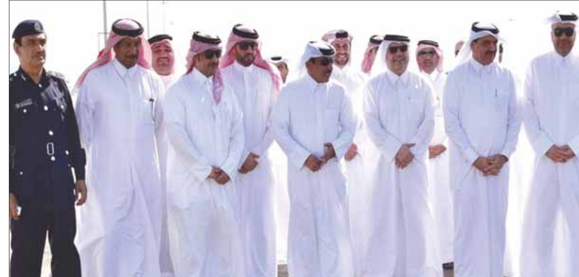
HE the Minister of Transport and Communications and HE the Minister of Municipality and Environment attend the opening of the new road along with a number of dignitaries and officials.