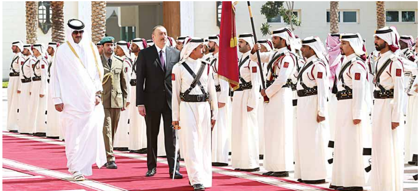
HH the Emir Sheikh Tamim bin Hamad al-Thani and Azerbaijan President Ilham Aliyev reviewing a guard of honour at the Emiri Diwan yesterday.